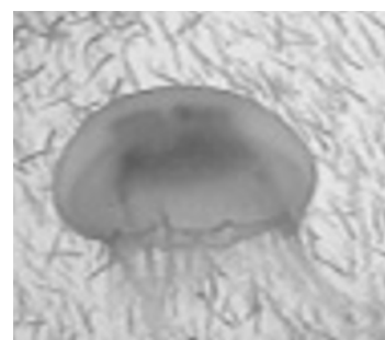
Fig. 2. Example of jellyfish.